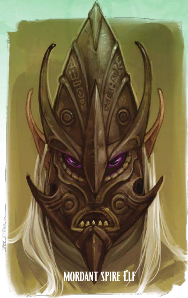
MORDANT SPIRE ELF

At the far western tip of the Varisian archipelago exists a strange nation of masked gray elves known as the denizens